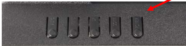
Buttons located on the back side of the LCD